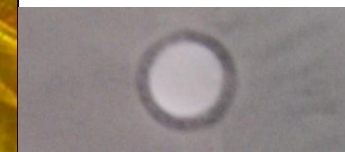
Fig. 2. Example of a disk diffusion challenge assay using a bicephalic amphiphile showing a zone of bacterial inhibition surrounding a treated disk.